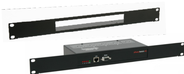
EPS 4M+ in 19" rack mounting kit Ref RMK-4 (in option).

Access to the ePowerSwitch is protected by name and password. The administrator account allows complete configuration and control of all power outlets over a web browser. The administrator can create up to 40 concurrent user accounts with restricted rights.